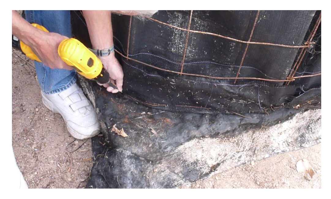
Figure 5. Screwing the Base of the Cage to the Pallet