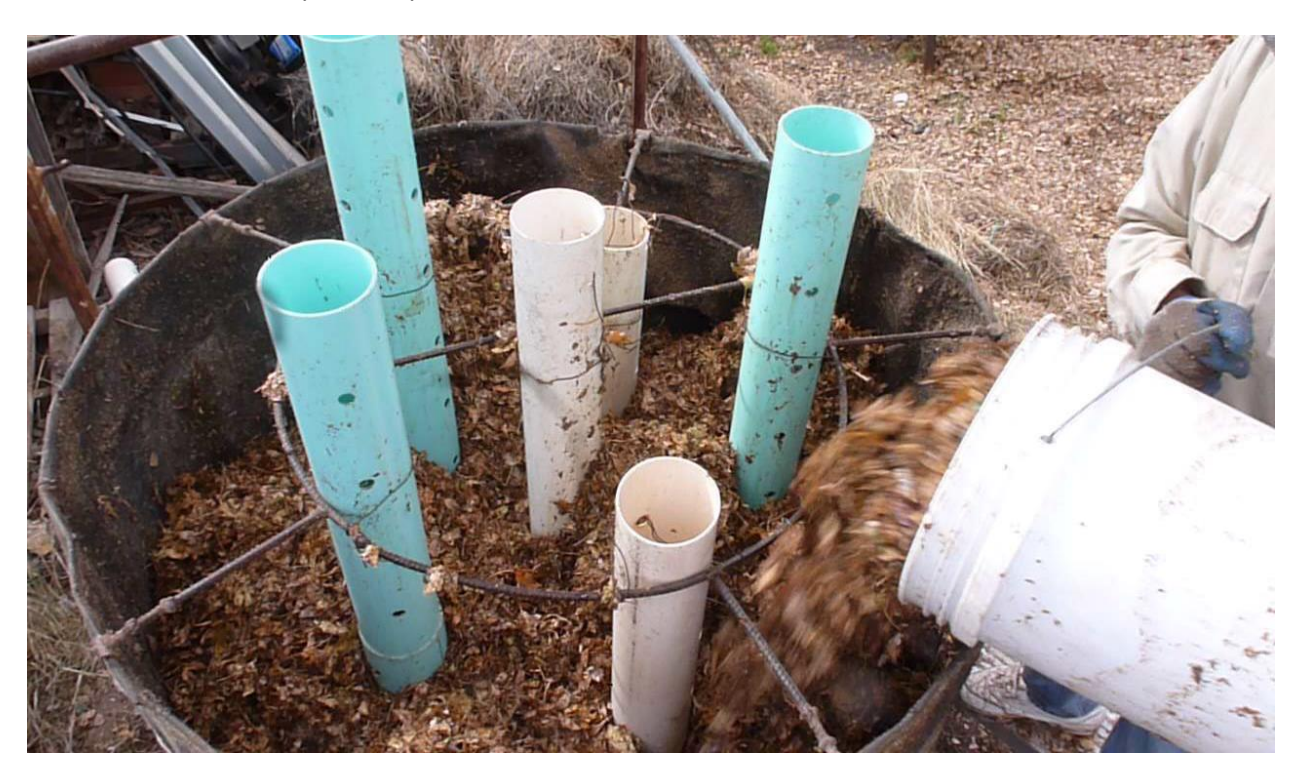
Figure 7. Filling the Bioreactor

Typically, I fill 6-9 buckets with wetted compost, dump each of these buckets into the bioreactor, then fill another 6-9 buckets and repeat the process.