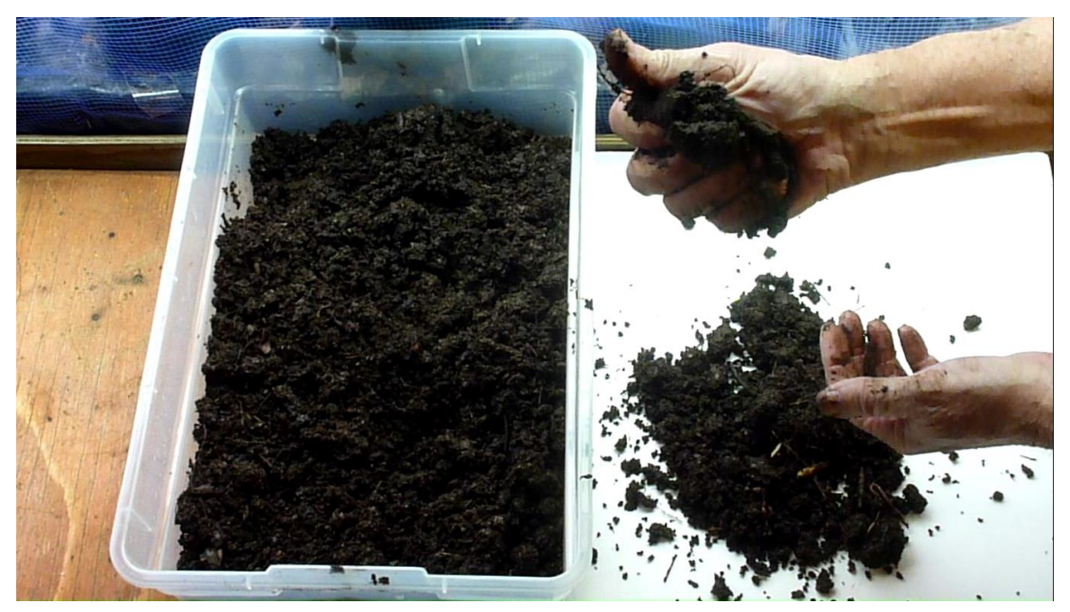
Figure 10. Mature Compost from a Johnson-Su Bioreactor. See also the video at https://www.dropbox.com/s/2fhy9zex8f3345i/P1040302.MOV?dl=0.

After a composting period of 9 months to a year, the compost product from a Johnson-Su bioreactor (Figure 10) can be used as it is, made into a slurry to coat seeds, or used to make an extract that can be sprayed on a field or into the furrow as you plant seeds.