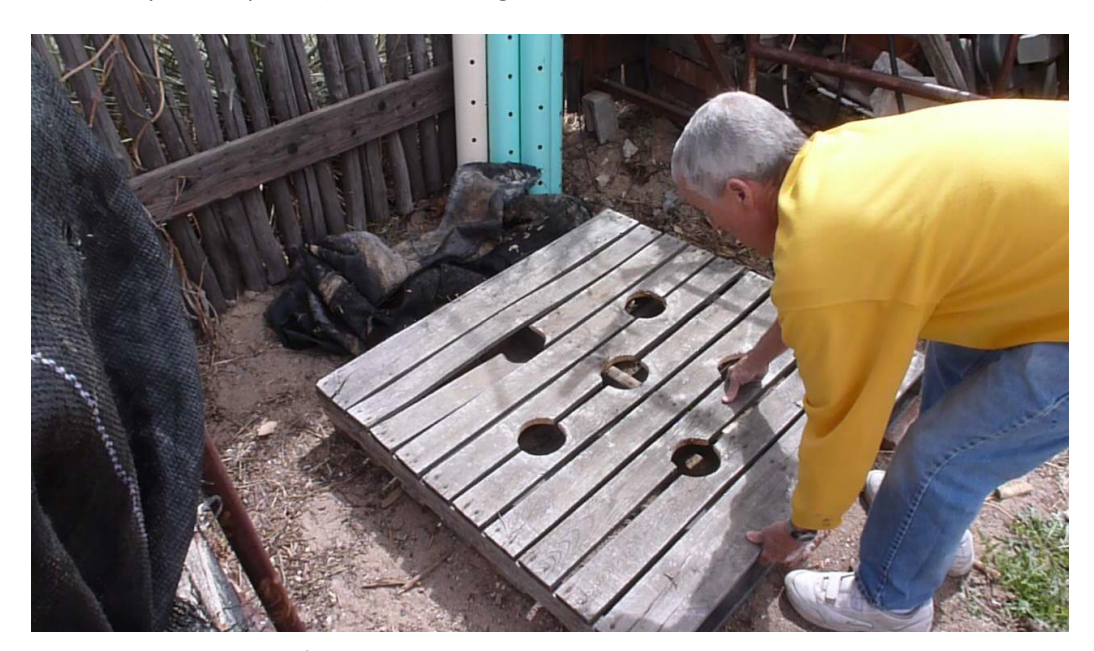
Figure 3. Positioning of Holes in Pallet

The pallet serves as the base for the Johnson-Su bioreactor, and it supports both the remesh/groundcloth cylinder and the septic system drain field pipes. To let the pallet hold the pipes in place, you'll use a jigsaw to cut six 4 %" holes in the top of the pallet (as shown in Figure 3).