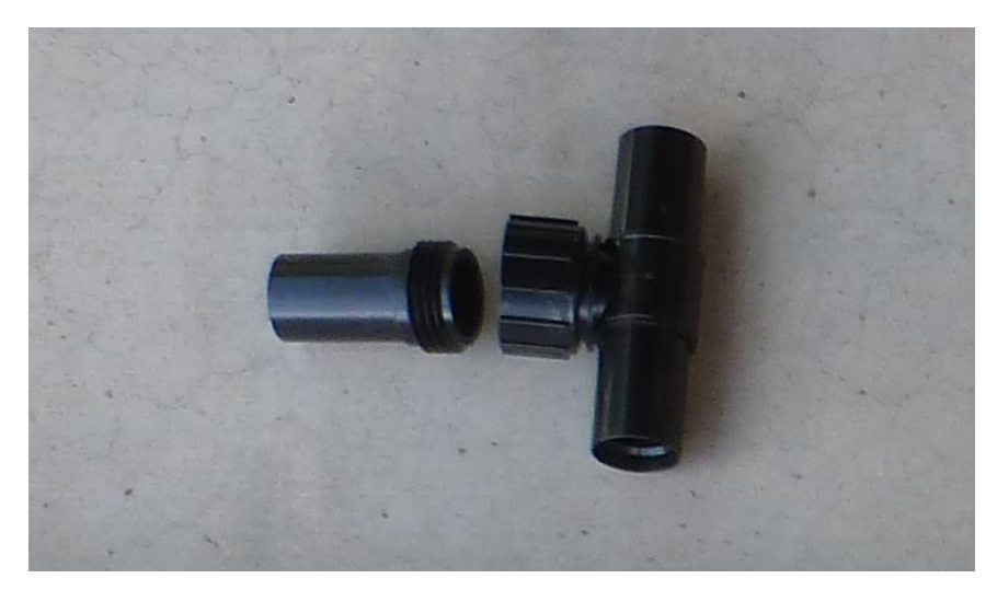
Figure 9. T-hose Fitting for the Irrigation System

The irrigation system adds sufficient water to the bioreactor when attached to a garden hose or typical ½" landscape irrigation hose with water pressure between 30-50 psi. It is best to hook this hose up to a timed sprinkler system (timed to irrigate the reactor 1 minute/day, or 2 minutes/day in temperatures above 100 °F) to ensure that the pile has adequate water and is not allowed to dry out.