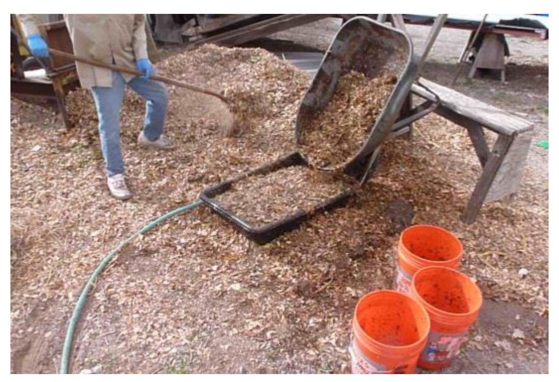
Figure 6. Setup for Wetting Feed Materials

Once the feed materials are thoroughly wet, I use a pitchfork to lift them into a wheelbarrow that is braced into a tilted position (Figure 6) so that water can drain off of the feed material and back into the water-bath tray. This uses the water efficiently.