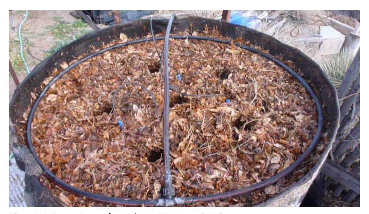
Figure 8. Irrigation System for a Johnson-Su Composting Bioreactor

To irrigate the system, I use a circular piece of \frac{1}{2} " landscape hose that snakes around the top perimeter of the bioreactor (Figure 8). I drill \frac{1}{16} " holes into the bottom of the hose every 4-5", and also I drill some holes horizontally in the hose about every 6". The horizontal holes spray towards the center of the bioreactor to thoroughly wet all the material. I connect the ends of this hose with a plastic landscape T-hose fitting that has two \frac{1}{2} " female push-compression fittings and a female hose-bib thread (Figure 9). Once the water has been sprayed onto the top of the compost substrate, gravity will pull the water from the top of the pile into the rest of the compost substrate.