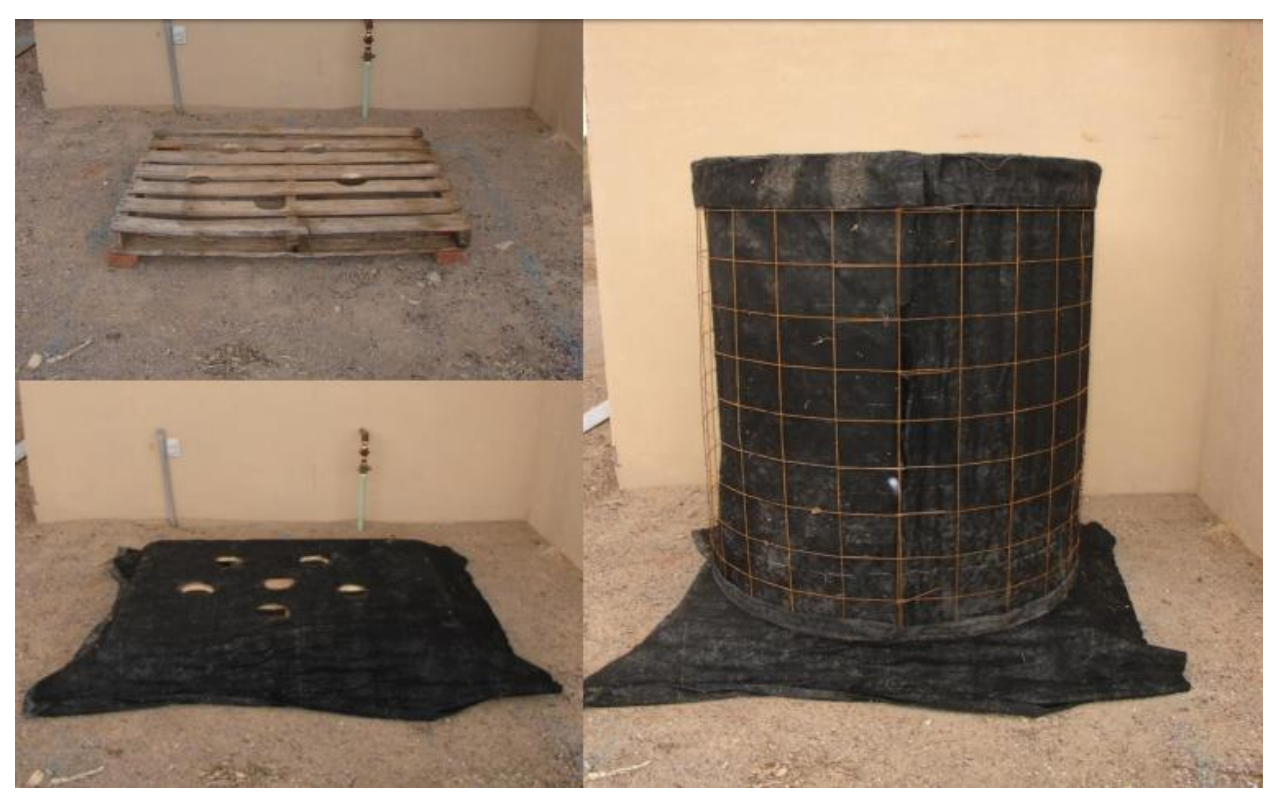
Figure 2. A Johnson-Su Composting Bioreactor

After you build a Johnson-Su bioreactor (Figure 2), you can reuse it many times.