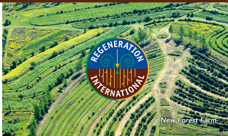
New Forest Farm

FORTUNATELY, THE SOLUTION IS RIGHT UNDER OUR FEET.