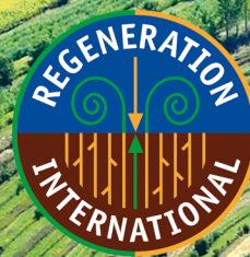
New Forest Farm